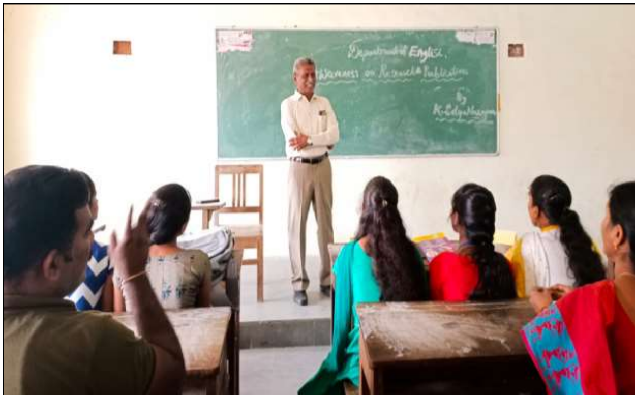
A Guest Lecture to Create awareness on Research and Publication for P G Students on 12-09-2019